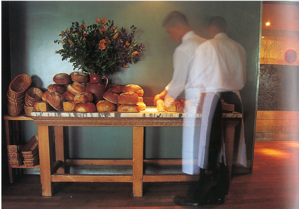
'The entrance to the kitchen has a powerful mural, inspired by St Ives artists of the 1930s and 1940s, such as Ben Nicholson and Barbara Hepworth'.